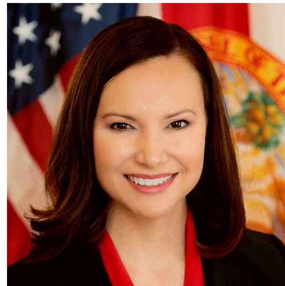
ASHLEY MOODY ATTORNEY GENERAL