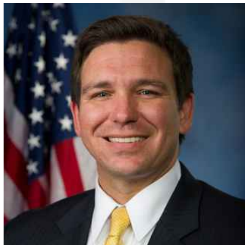
RON DESANTIS FLORIDA GOVERNOR