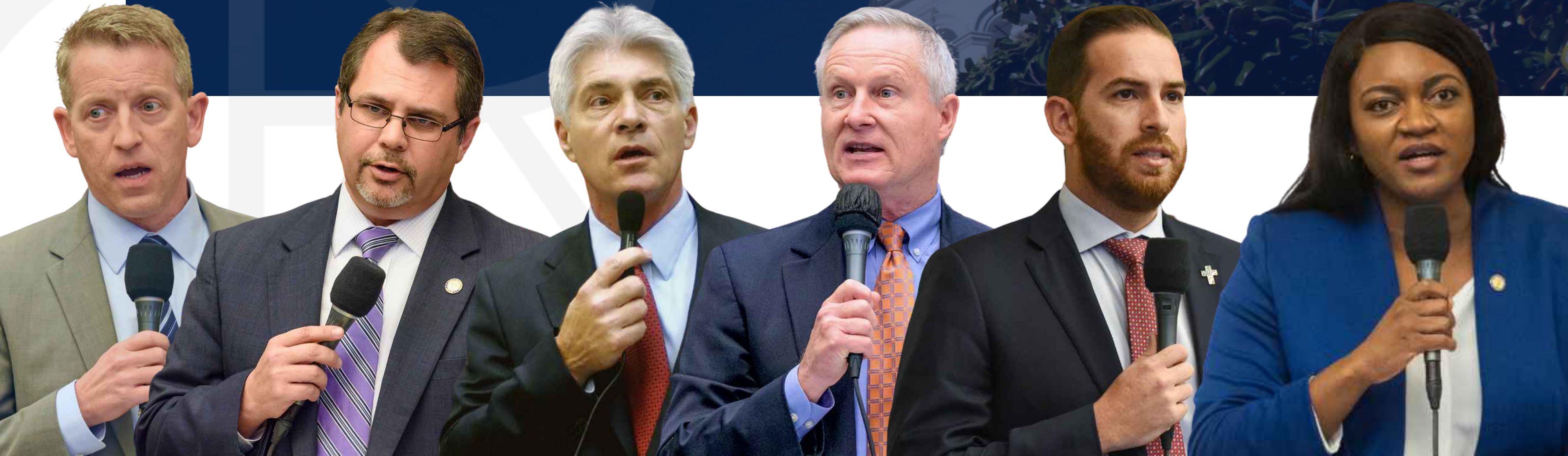
PAUL RENNER SPEAKER OF THE HOUSE