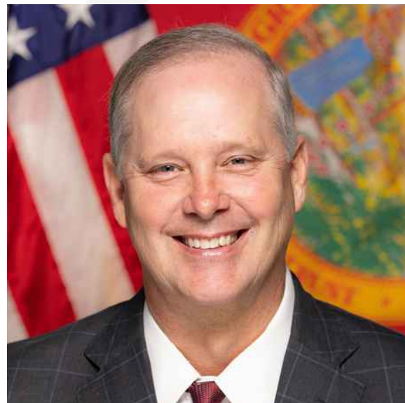
WILTON SIMPSON COMMISSIONER OF AGRICULTURE AND CONSUMER SERVICES